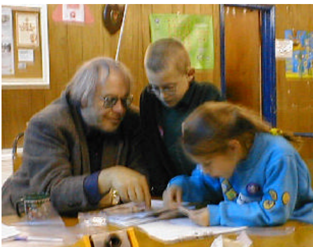
GB4FS - Badge work

This station had too many UK Scout contacts to mention! They also contacted 4 Dutch Scout stations and had an interesting contact with KH6FV in Hawaii. Scouts had a sleep-over and 13 people built AM receivers, all of which worked except for that built by the DC! Eight Radio Communications badges and seven Electronics badges were gained.